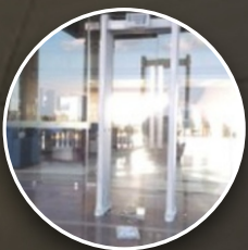
Airport, Railway Station