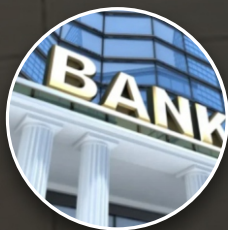
Banks & ATM